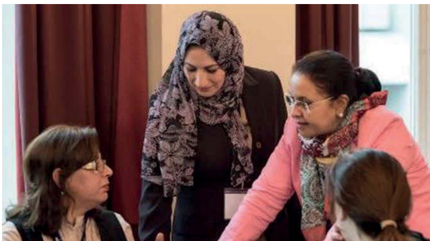
In the search for answers: pressing questions of the present were discussed in Berlin by the conference participants