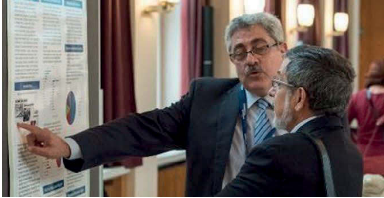
In the dialog: The exceed conference brought together scientists across many disciplines