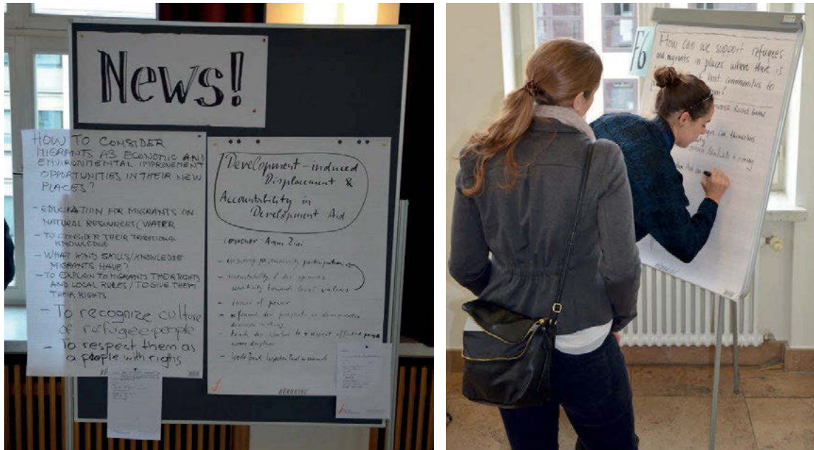
Figure 3: Notes of the exploratory sessions for review

After the exploration phase, the action phase started. At the beginning, participants were given the chance to review the notes of the exploration phase (Figure 3) and to brain-storm about which topics might be linked. After that, in a 2nd market place, the final projects were suggested to be worked on after the conference. These were then discussed during a 90 minute session during which project goals and next steps were defined on premade forms. Results were then presented to the whole group.