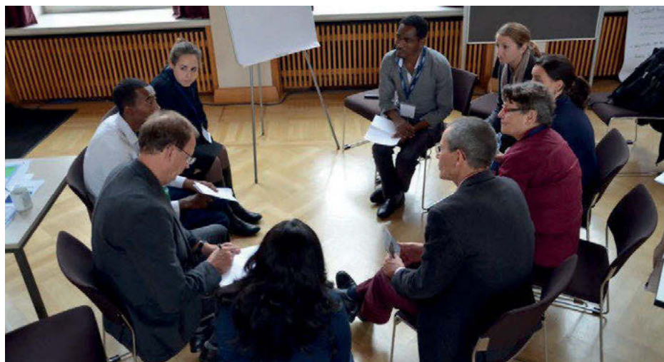
Figure 2: Group discussion during the exploration phase

During the three sessions of the exploration phase (Figure 2; 1 hour each, interrupted by a 1 hour lunch break), 23 of the 28 suggested topics were discussed and reported back (Table 2). Ten of them focused on prevention of migration while the remaining 13 focused on improvement of the situation for refugees. They covered flight related employment aspects ( n=4 ), environmental concerns ( n=2 ), health conditions and nutrition ( n=4 ), social and socio-economic aspects ( n=5 ) and political questions ( n=4 ). Also discussed by two groups was the question of what Higher Education Institutions might contribute in terms of research, training and development aid. Topics were suggested by partners from thirteen different countries; 16 of the topics by partners outside Germany. All Exceed centers suggested different topics. Group size varied between 2 and 22 participants.