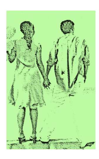
March 17, 2018 9AM-5PM

Anatomical Institute Pettenkoferstr. 11 (Lecture Hall A202) Munich, Germany